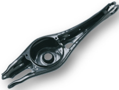
Control arm in automotive engineering

The LAW has established itself as an additional quality feature. The bainitic steels of SZFG are characterized by high hole expansion value.