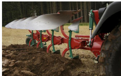
Example: turning plow

In addition, it must be noted that when welding these steels in the quenched and tempered state, tempering effects can occur in the joining zone. This can reduce the strength of the joint compared to the base material that was strongly solidified by the preceding hot-forming process.