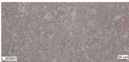
Tempered state, water cooled 200:1