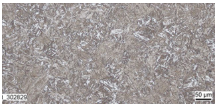
Hardened state, water cooled 200:1

In the hardened and tempered state, after suitable heat treatment the manganese-boron steels form a microstructure consisting of 100% martensite: